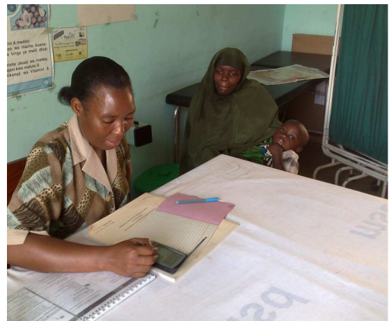
Figure 3: Clinician using e-IMCI prototype with a patient.

For the actual study, we first conducted interviews with the five clinicians in order to understand their level of experience with computing devices, experience with IMCI and preconceptions about using the PDA to administer the protocol.