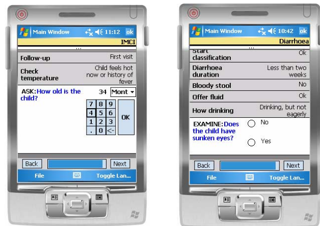
Figure 2: The e-IMCI interface.

The third question asks about the major symptoms that the patient is presenting with, such as: cough, diarrhea, fever