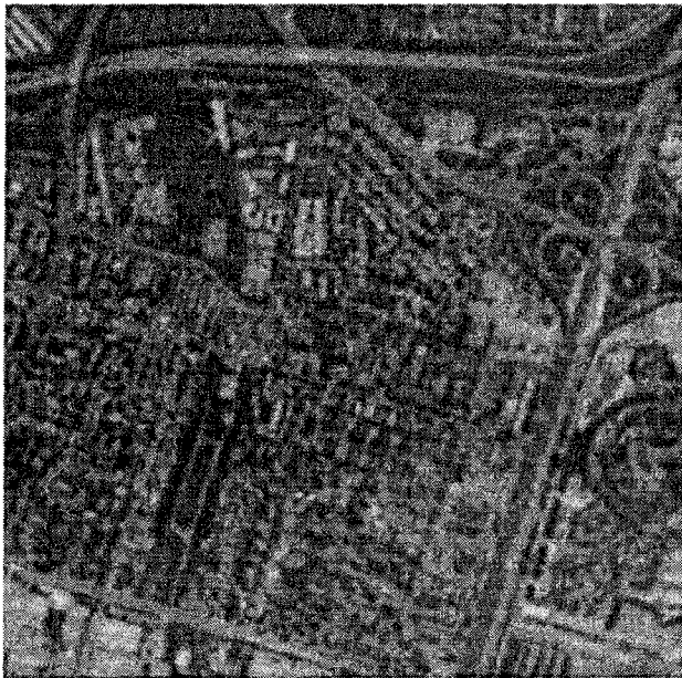
Figure 4: The blurred image.