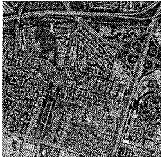
Figure 5: The compressed/restored image at 1.75 bits/pixel.