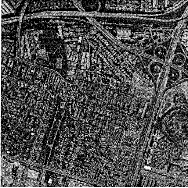
Figure 3: The original image.